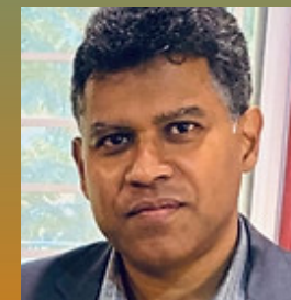
Nurul Wahab A. Wahab & Co./ Bangladesh