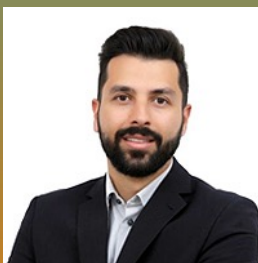
Ala M. Farahat & Co./UAE